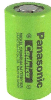
NICKEL CADMIUM: No tape required