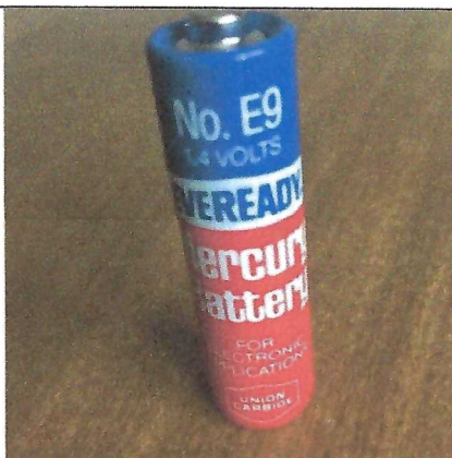
MERCURY BATTERY: No tape required