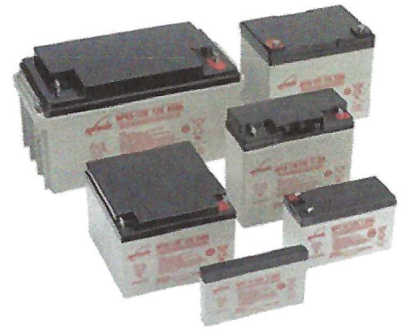
LEAD ACID: Tape all exposed terminals