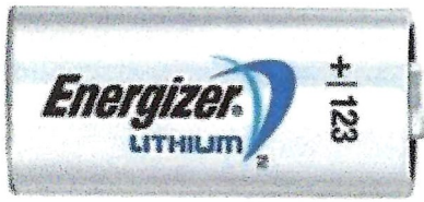
LITHIUM-ION: Tape all exposed terminals