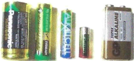
ALKALINE BATTERY: No tape required