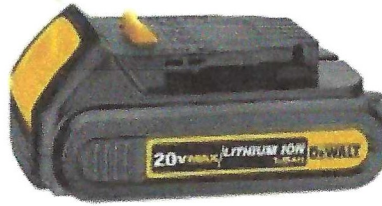
LITHIUM: Tape all exposed terminals