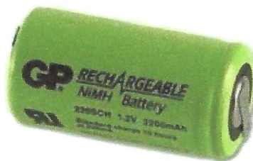
NICKEL METAL HYDRIDE: No tape required